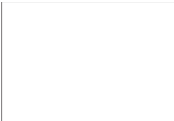
Figure 1. Example of a figure with caption. Captions are set in Roman, 9 point. Use a Drawing area to make space for figures.

When citing a multi-author paper, you may save space by using “et alia”, shortened to “ et al. ” (not “ et. al. ” as “ et ” is a complete word.) However, use it only when there are three